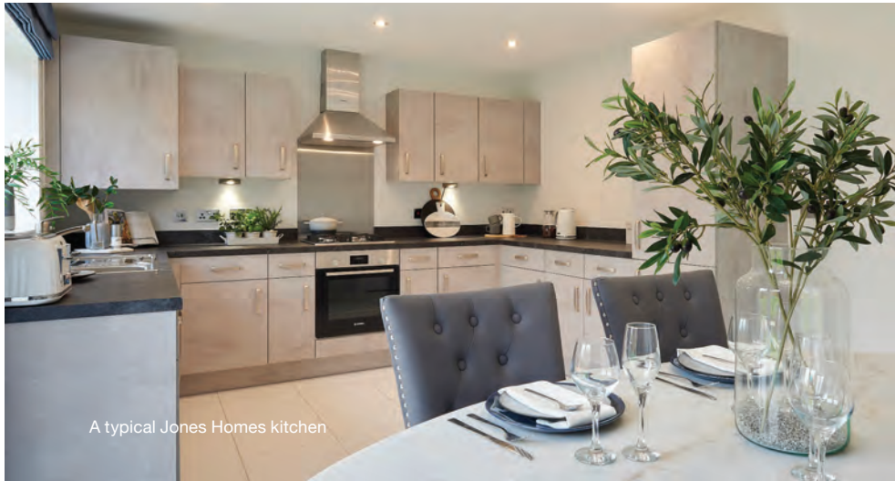
A typical Jones Homes kitchen