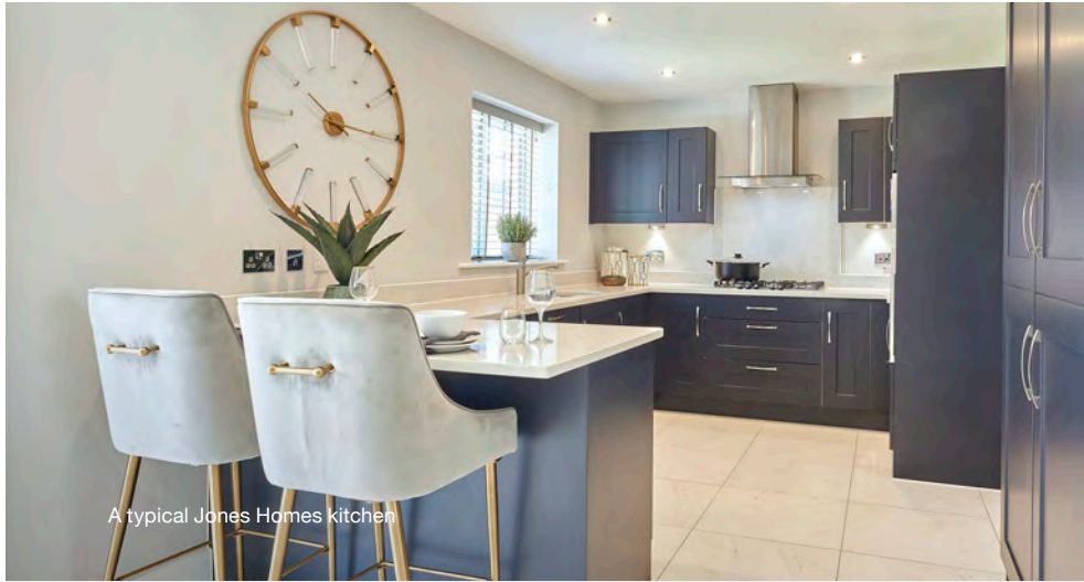
A typical Jones Homes kitchen